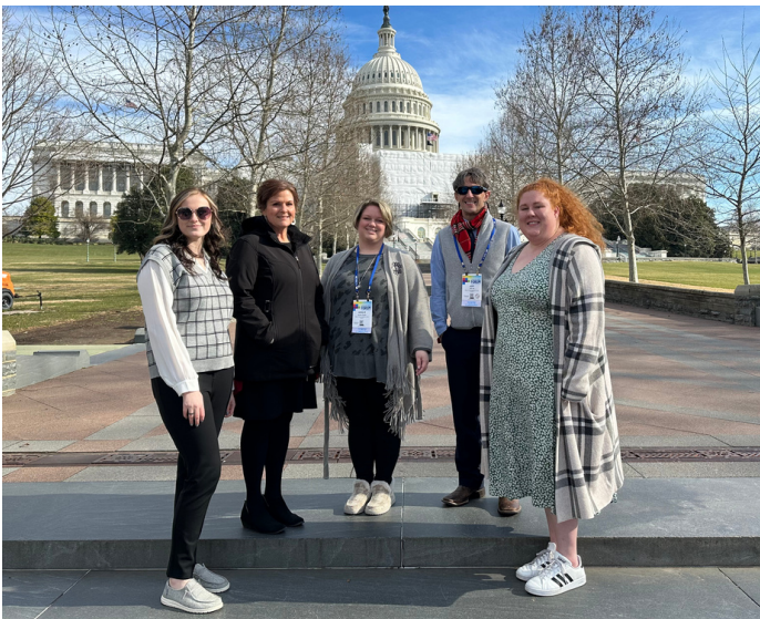
Wilson County Substance Prevention Coalition staff picture

Recovery Concepts Community Center (RC3) is a community recovery center and an initiative of The Wilson County Substance Prevention Coalition, created in 2017. This community center is for those working to sustain and maintain their recovery from substance use disorders can visit the center to take part in educational opportunities, group meetings, social events, or just to hang out in a place that is recovery informed, friendly, and healthy.