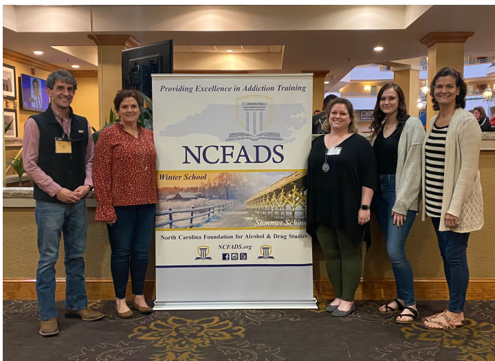
Wilson County Substance Prevention Coalition staff picture

Recovery Concepts Community Center (RC3) is a community recovery center and an initiative of The Wilson County Substance Prevention Coalition, created in 2017. This community center is for those working to sustain and maintain their recovery from substance use disorders can visit the center to take part in educational opportunities, group meetings, social events, or just to hang out in a place that is recovery informed, friendly, and healthy.