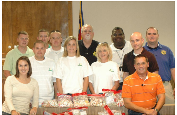
Early members of the Wilson County Substance Prevention Coalition participating in a drug take-back event.

The Wilson County Substance Prevention Coalition turns 15 this month. The Coalition was established in April 2007 and has been working towards making sure that every Wilson County resident is able to access comprehensive substance use prevention, treatment, and recovery resources quickly, easily, and without judgment.