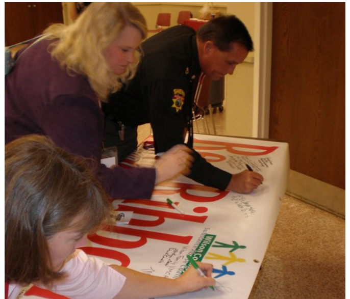
Community members signing a Red Ribbon week sign for the Wilson County Substance Prevention Coalition during Red Ribbon week in 2011.