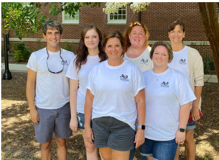
Wilson County Substance Prevention Coalition staff picture

Recovery Concepts Community Center (RC3) is a community recovery center and an initiative of The Wilson County Substance Prevention Coalition, created in 2017. This community center is for those working to sustain and maintain their recovery from substance use disorders can visit the center to take part in educational opportunities, group meetings, social events, or just to hang out in a place that is recovery informed, friendly, and healthy.